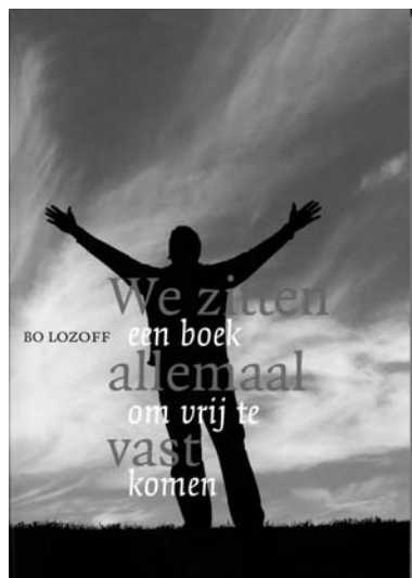
We're All Doing Time in Dutch

This means We're All Doing Time is now available in English, Spanish, French, Italian, Dutch, and Czech, and we hear rumors that prisoners in far-flung places have been translating sections into Russian, German, Sinhala, Hindi, Farsi, and who knows how many others?